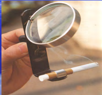
Solar Powered Cigarette Lighter