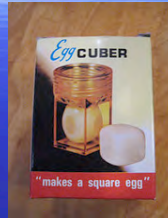
Square Egg Maker