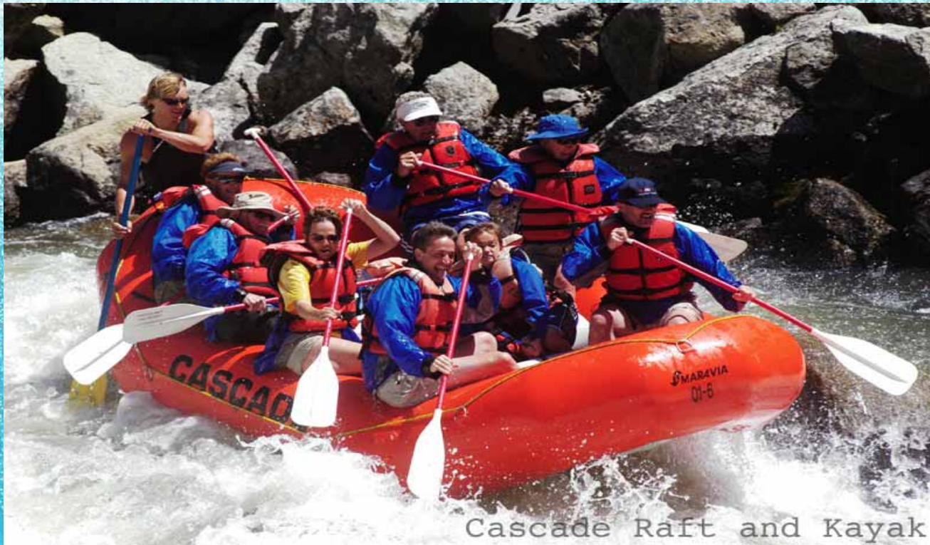
Cascade Raft and Kayak