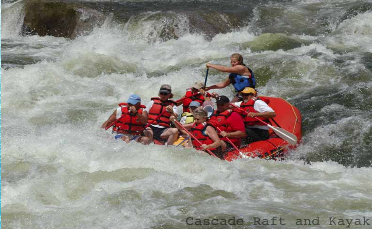
Cascade Raft and Kayak