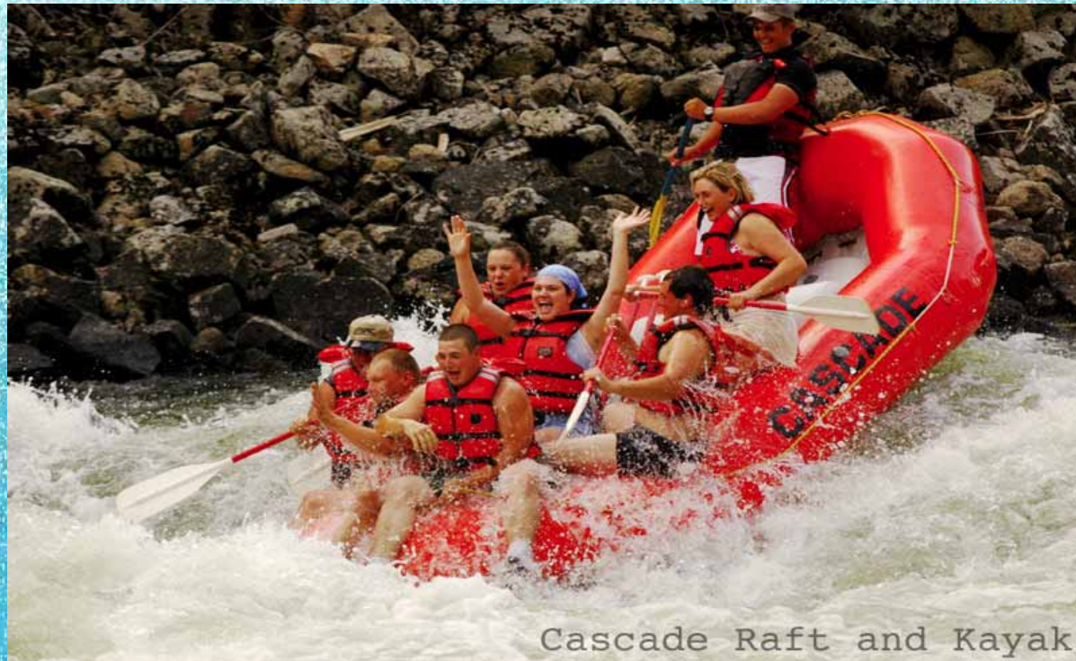
Cascade Raft and Kayak

Talk to some people who have used the solutions and services.